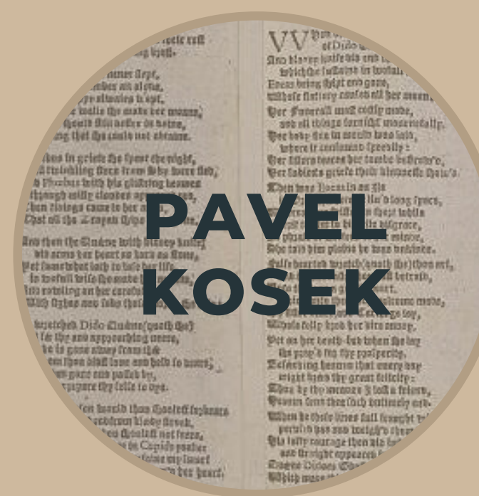
From the Foreign Perspective: Czech Broadside Ballads